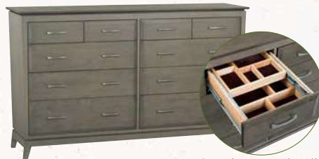
Jewelry tray detail.