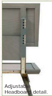
Adjustable Headboard detail.