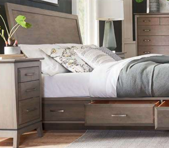
2235AST Queen Adjustable Storage Bed, 2115AST Small 3-Drawer Nightstand and 2143AST 6-Drawer Chest.