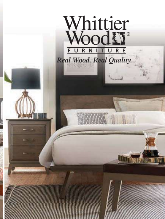
3910AST Queen Alder Adjustable Headboard Platform Bed, 2116AST 3-Drawer Nightstand and 2140AST Upholstered Bench.