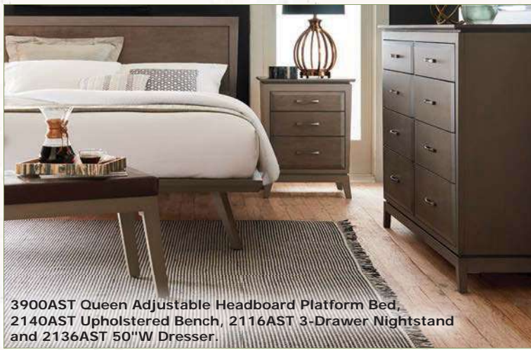
3900AST Queen Adjustable Headboard Platform Bed, 2140AST Upholstered Bench, 2116AST 3-Drawer Nightstand and 2136AST 50\"/>