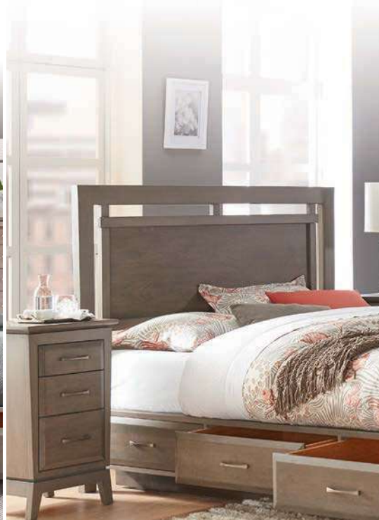
2218AST Queen Panel Storage Bed and 2116AST 3-Drawer Nightstand.