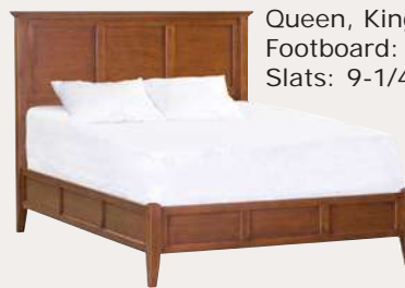
Queen, King & Cal-King: Footboard: 17-1/2"H Slats: 9-1/4"H