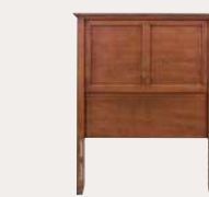
• Twin Headboard #1302 45"W x 3-1/2"D x 50-1/2"H