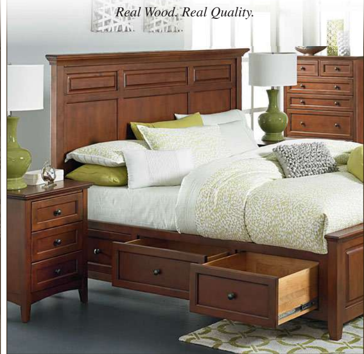
Shown here: 2319GAC King Mantel Storage Bed, 1101GAC 3-Drawer Nightstand and 1180GAC 6-Drawer Chest in Glazed Antique Cherry finish.

D istinctive design and elegant details make for a striking combination in this stylish bedroom collection. Made from certified sustainable American Alder and Alder veneered hardwoods, this line includes heritage-quality craftsmanship details such as English dovetail drawers, mortise and tenon joinery and fitted backs. Whisper-quiet full extension metal ball bearing drawer slides provide maximum access to spacious drawers. We're sure you will appreciate how these and other Whittier standard features enhance your family's daily lives. We look forward to helping you create your well-furnished and well-loved home.