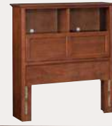
• Twin Bookcase Headboard #1361 45"W x 14"D x 50-3/4"H

Not compatible with the #1359 Twin Bookcase Storage Bed or #1361 Twin Bookcase Headboard.