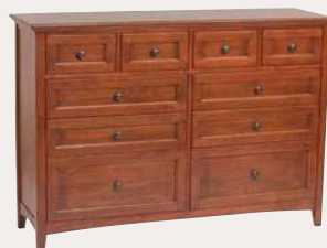
• 10-Drawer Dresser #1128 60"W x 18-3/4"D x 42"H