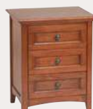
• 3-Drawer Nightstand #1101 23"W x 18-3/4"D x 29-1/2"H