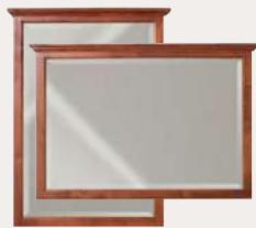
• Beveled Mirror #1500 Horizontal: 42-1/2"W x 28-3/4"H Vertical: 30-1/2"W x 40-3/4"H Base Assembly: 28"W x 40"H Both moldings included. Mount on wall or select dressers: #1127; #1128; #1131; #1183.