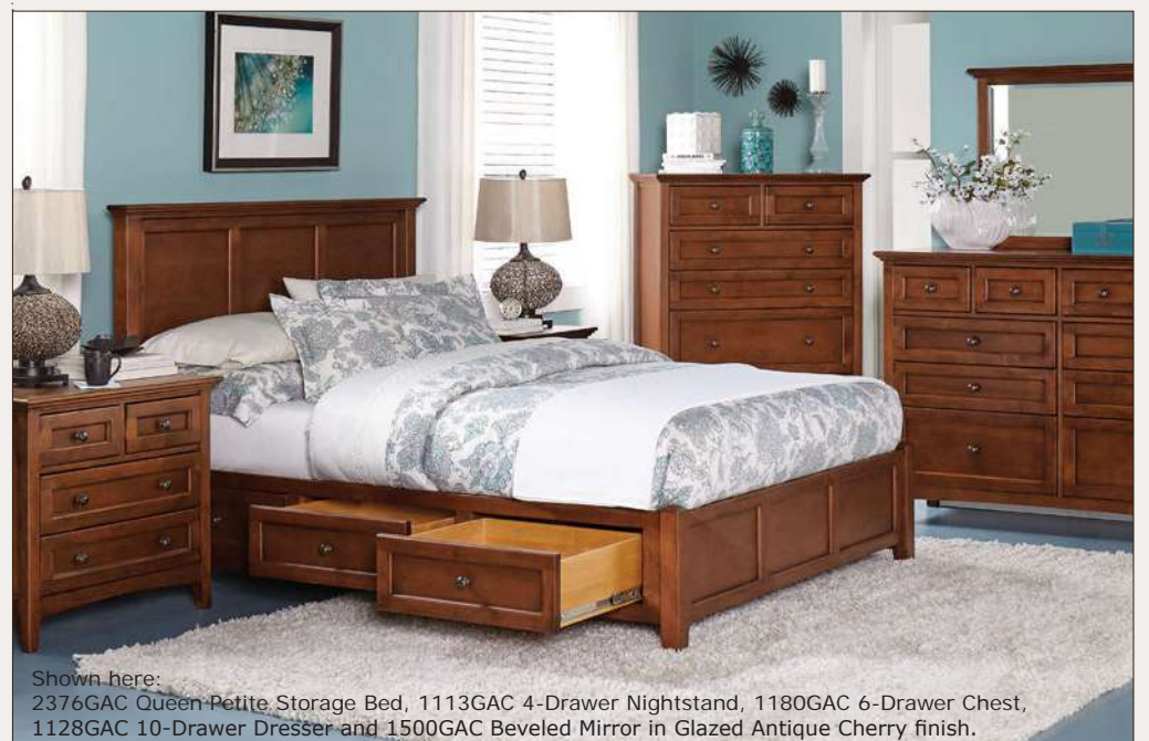
Shown here: 2376GAC Queen Petite Storage Bed, 1113GAC 4-Drawer Nightstand, 1180GAC 6-Drawer Chest, 1128GAC 10-Drawer Dresser and 1500GAC Beveled Mirror in Glazed Antique Cherry finish.