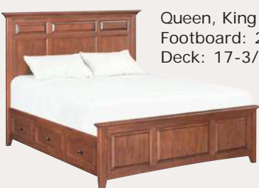
Queen, King & Cal-King: Footboard: 23"H Deck: 17-3/4"H