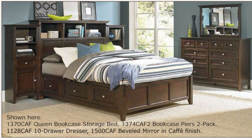
Shown here: 1370CAF Queen Bookcase Storage Bed, 1374CAF2 Bookcase Piers 2-Pack, 1128CAF 10-Drawer Dresser, 1500CAF Beveled Mirror in Caffè finish.