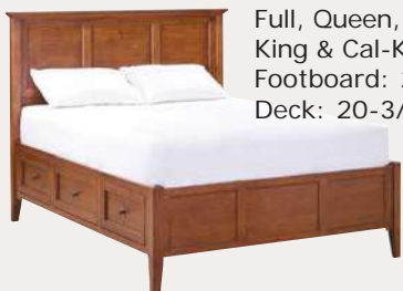
Full, Queen, King & Cal-King: Footboard: 22-1/2"H Deck: 20-3/4"H

All Full, Queen, King and Cal-King storage bed sizes have six spacious drawers. The #1300 Twin bed has three spacious drawers that can be installed on the left or right. All drawers are equipped with maximum access, full extension metal ball bearing drawer slides.