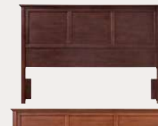
• Full/Queen Headboard #1357 66-1/4"W x 3-1/2"D x 55-1/2"H