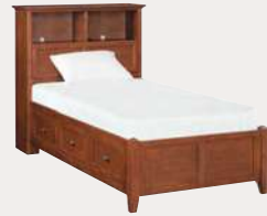
• Twin Bookcase Storage Bed #1359 45"W x 88"L x 50-3/4"H Platform: 39-1/4"W x 75"L Twin, Full, Queen, King & Cal-King: Footboard: 19-1/2"H Deck: 17-3/4"H