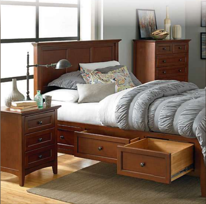
Shown here: 1316GAC Queen Storage Bed, 1101GAC 3-Drawer Nightstand and 1180GAC 6-Drawer Chest shown in Glazed Antique Cherry finish.

Whittier Wood FURNITURE Real Wood. Real Quality.