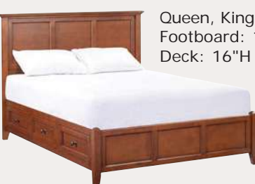
Queen, King & Cal-King: Footboard: 17-3/4"H Deck: 16"H