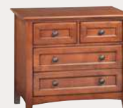
• 4-Drawer Nightstand #1113 32-1/2"W x 18-3/4"D x 29-1/2"H