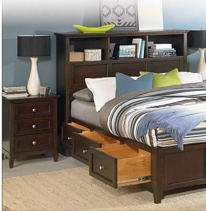
Shown here: 1370CAF Queen Bookcase Storage Bed and 1101CAF 3-Drawer Nightstand in Caffè finish.