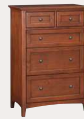
• 5-Drawer Tall Chest #1129 32-1/2"W x 19-1/2"D x 48"H