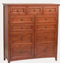
• 11-Drawer Chest #1181 50"W x 18-3/4"D x 54"H