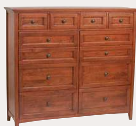
• 12-Drawer Dresser #1182 60"W x 18-3/4"D x 54"H