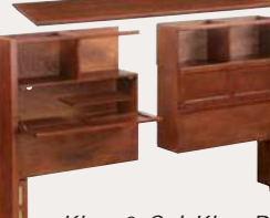
• Queen Bookcase Headboard #1372 66-1/2"W x 14"D x 55-3/4"H