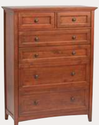
• 6-Drawer Chest #1180 40"W x 19-1/2"D x 54"H