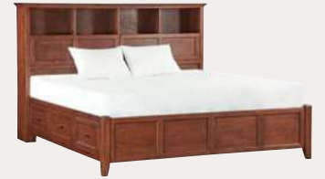
• King Bookcase Storage Bed #1375 82-1/2"W x 95-1/4"L x 55-3/4"H Platform: 76-1/2"W x 80-1/2"L • Cal-King Bookcase Storage Bed #1380 78-1/2"W x 97-3/4"L x 55-3/4"H Platform: 72-1/2"W x 83-3/4"L