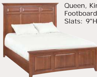
Queen, King & Cal-King: Footboard: 23"H Slats: 9"H