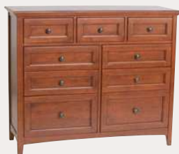
• 9-Drawer Dresser #1127 50"W x 18-3/4"D x 42"H