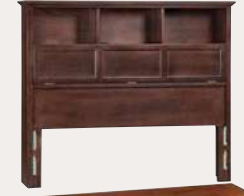
• Full Bookcase Headboard #1367 60-1/2"W x 14"D x 55-3/4"H