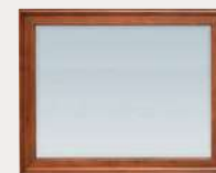
• Rectangular Mirror #1505 42-1/2"W x 35-1/2"H Wall mount vertically or horizontally. Horizontal dresser mount on: #1127; #1128; #1131; #1183.