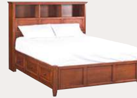
• Full Bookcase Storage Bed #1365 60-1/2"W x 89-1/2"L x 55-3/4"H • Queen Bookcase Storage Bed #1370 66-1/2"W x 95-1/4"L x 55-3/4"H Platform: 60-3/4"W x 80-1/2"L