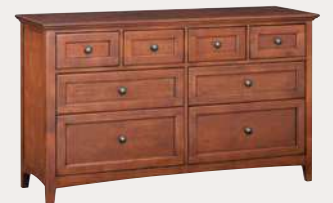
• 8-Drawer Dresser #1131 60"W x 18-3/4"D x 36"H