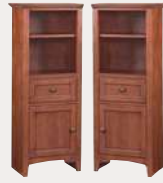
• Bookcase Piers 2-Pack #1374 21-1/4"W x 14"D x 52-3/4"H