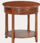
• Round End Table #3510 24-3/4"H x 26"D